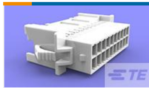
TE Part # 1-1969593-8 HSG,REC,FREE-HANGING,GWT, DUALROW,EP2.5