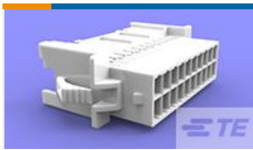
TE Part # 1-1969593-0 HSG,REC,FREE-HANGING,GWT, DUALROW,EP2.5