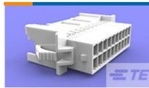
TE Part # 2-1969593-0 HSG,REC,FREE-HANGING,GWT, DUALROW,EP2.5